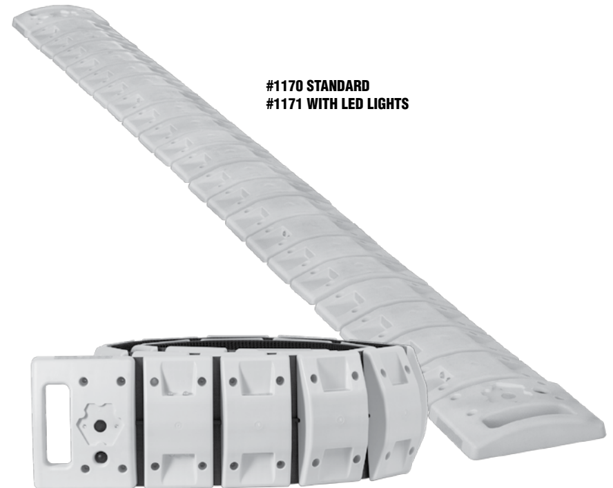
#1170 STANDARD #1171 WITH LED LIGHTS